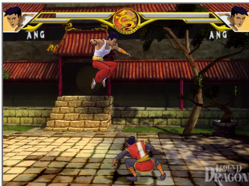
Master Chin's dojo