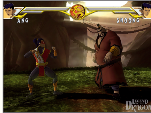
Ang receives lessons from Pig Guardian