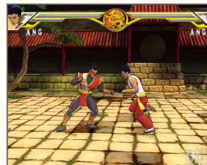
Ang vs. his guardian mode; The Golden Dragon