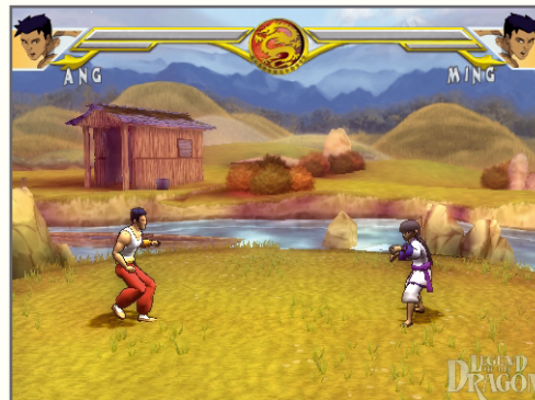
Fight in out door environment